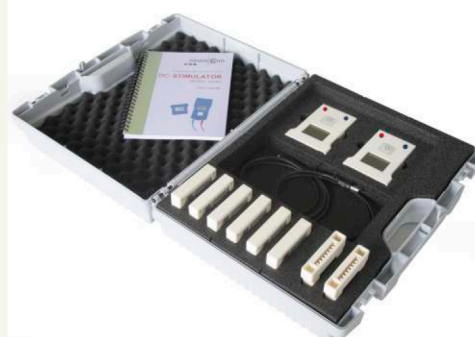
basic set of devices