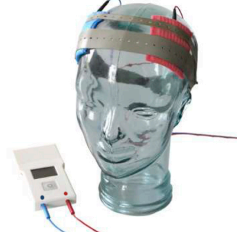
example of use

neuroConn GmbH Albert-Einstein- Straße 3 98693 Ilmenau Germany